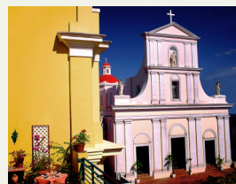
WIDE ANGLE LENS or 20-38mm ZOOM LENS