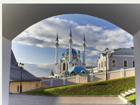
MEDIUM TELEPHOTO LENS or 70-200mm ZOOM LENS