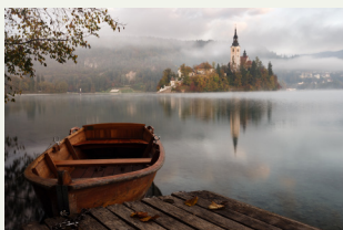
TELEPHOTO LENS or 100-300mm ZOOM LENS